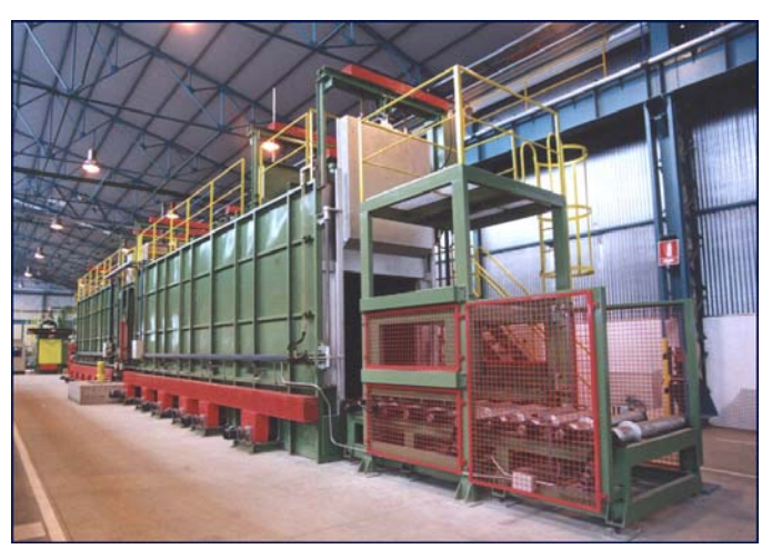
General view of T6 Heat Treatment Installation based on lineal arrangement.