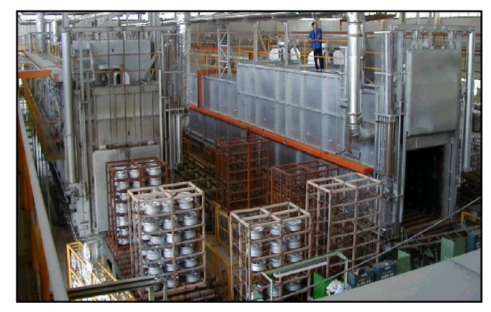
General view of T6 Heat Treatment Installation based on "U" type arrangement.