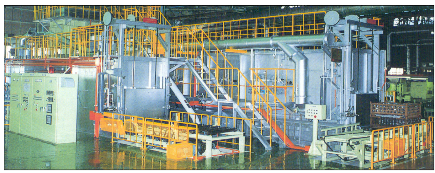
T6 Heat Treatment Installation provided with loading and unloading tables.